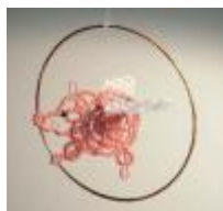
Click for larger picture