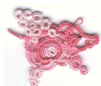
Click for larger picture

Materials required:- No. 20 thread, one small bead for eye, 2 shuttles. The completed pig with wings measures approx. 1 ¾" x 1 ¾".