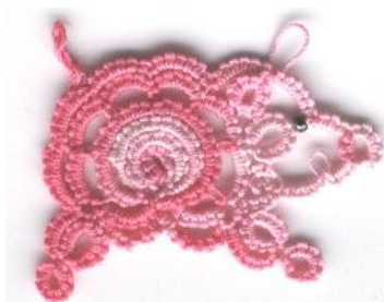
Click for larger picture

This is one of a series of 3 onion ring designs and is a 'convertible' flying pig (an owl and an elephant are also in this set). The wings are separate and can be added if required. Thanks to Pamela Myers who has submitted a second wing. To make an onion ring please see this page .